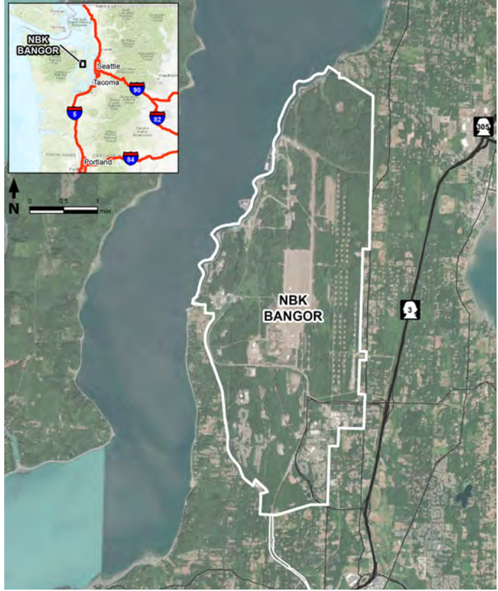
Figure 1 - NBK Bangor

To be protective, the Navy will provide bottled water for drinking and cooking to any resident in the designated sampling areas whose drinking water well contains PFOA and/or PFOS above the EPA lifetime health advisory. The Navy will provide bottled water until a long-term solution is implemented.